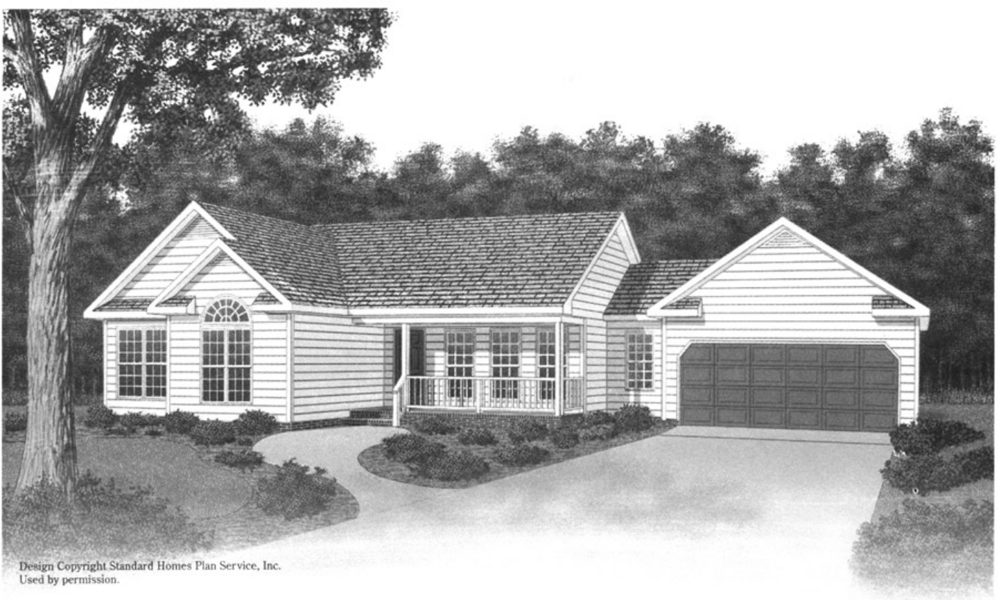
Design Copyright Standard Homes Plan Service, Inc. Used by permission.